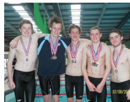
SSC Boys Relay Team