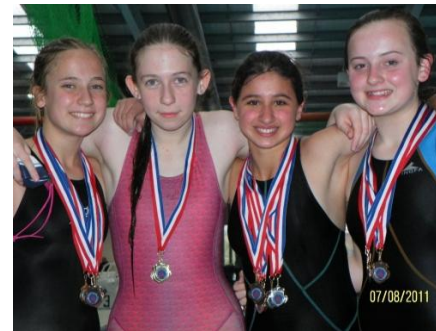
SSC Girls Relay Team

Coming soon is an AMAZING OPPORTUNITY for local businesses to ADVERTISE in our newsletter. The newsletter goes out once a term to all of our families and is handed out at shopping centre promotions. That's a circulation of over 800 families! To register your interest in this exciting opportunity, please speak to one of our friendly reception staff.