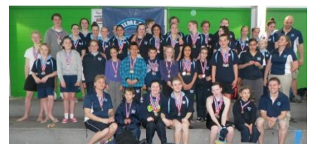
Western Regional Meet Competitors