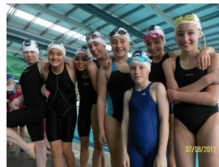
SSC Girls Relay Teams