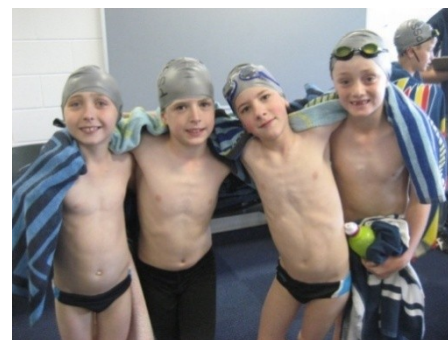
Boys 8 and Under Freestyle A Team