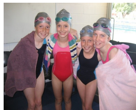
Girls 9 and Under Freestyle A Team