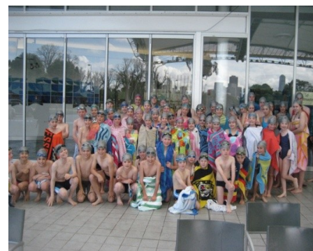
Bendigo Silver Caps Relay Day Team 2009