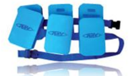
SUMMER PACK $27.00

Presentation Night – Sun 12 th Dec 4.00pm – 6.30pm