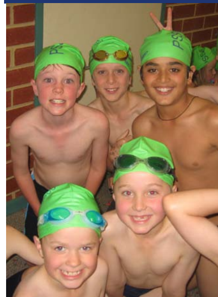
Some of our fantastic swimmers marshalling at Relay Day

We have Swordy towels, hats, toys, swim wear, rash vests and other swimming products.